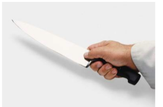
Gripping (holding the knife):

Find your own best way to hold the knife. It should be the safest way and one that you can control your actions.